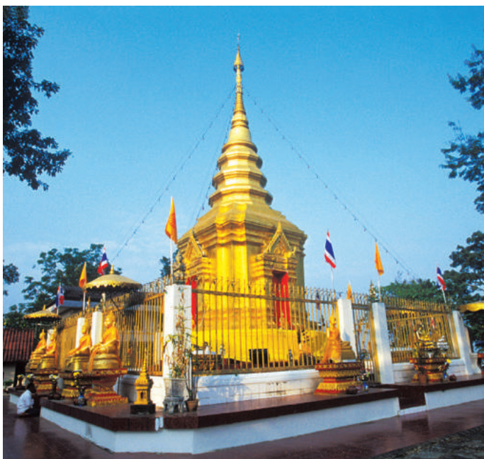
Wat Phrathat Doi Wao

Doi Langka (ดอยลังกา) is a hill of 2,000 m high, the 5 th ranking in Thailand, overlooking the attractive view of the park. There is a forest trekking route taking 4 days and 3 nights.