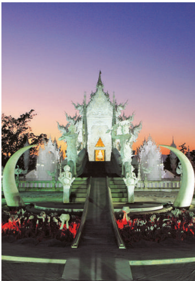
Wat Rong Khun