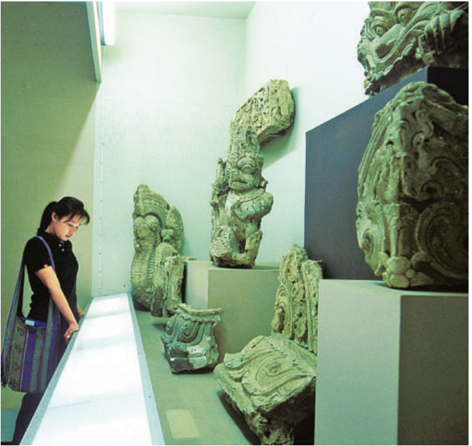
Museum of Buddha Images

for soaking at the price of 100 Baht per person. For further details, contact Tel: 08 1992 1472.