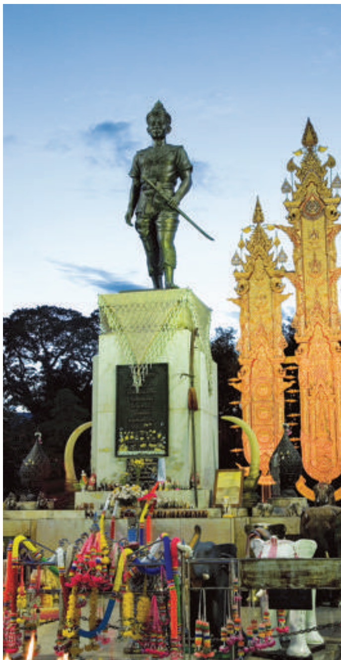
King Mengrai the Great Memorial