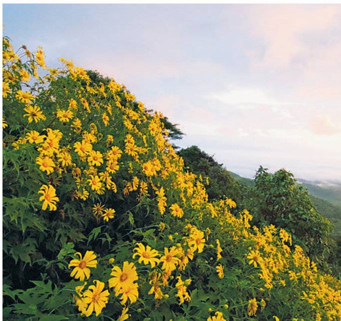
Buatong Ban or Blooming Mexican Sunflower

(งานดอกเสี้ยวบานที่ภูชี้ฟ้า) is scheduled to be mid of February at Mu 24 Baan Rom Fa Thai, Tambon Tub Tao, Amphoe Theong. The activities are hilltribes cultural performances, hilltribe traditional games, Miss Dok Siao beauty contest, view Dok Siao (White Wild Bauhinias) in full bloom. For details, contact Tambon Tub Tao Administration Organization Tel: 0 5360 9494, 0 5371 0194-6