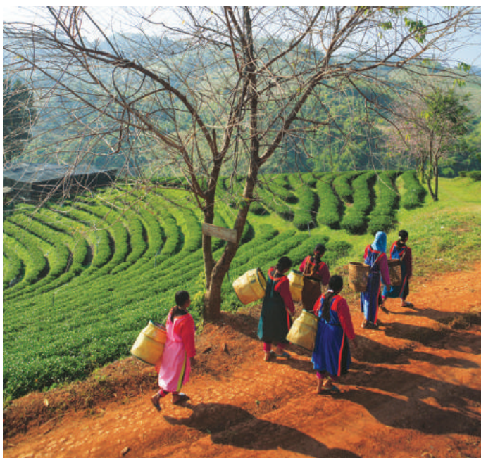
Good Tea Plantations, Doi Mae Salong

Tha Ton in Amphoe Fang, Chiang Mai, totalling 45 km. Alternatively, take a bus from the town of Chiang Rai to the entrance to Doi Mae Salong and take a mini-bus there. The fare is 50 Baht per person. A charter rate is 400 Baht per trip and 800 Baht for a return trip. For further details, contact Tel: 08 1024 0813.