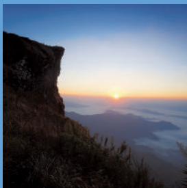
Phu Chi Fa