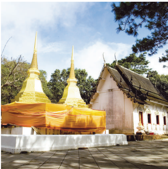
Wat Phrathat Doi Tung

Chiang Saen National Museum (พิพิธภัณฑสถานแห่งชาติเชียงแสน) is where knowledge can be sought concerning archaeology, settlements and history of the town. There are replicas of the community and scores of ancient relics including Lanna-style sculptures, Buddha statues and inscription stones from Phayao and Chiang Saen itself. In addition, there are exhibitions of indigenous art objects of the Thai Yai (ไทยใหญ่), Thai Lu (ไทยลื้อ) and other hilltribes. These items include musical instruments, ornaments,