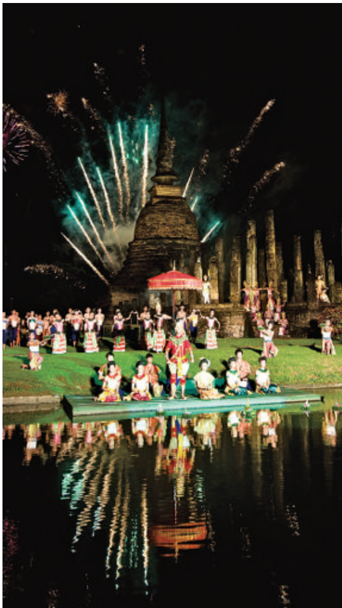
Mini Light and Sound Presentation Sukhothai Night