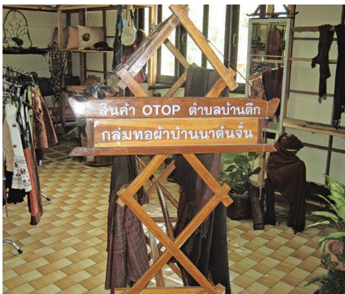
Ban Na Ton Chan Homestay

Si Satchanalai Elephant Back Ordination Procession (ประเพณีบวชพระแห่นาคด้วยช้างของชาวหาดเสี้ยว) A traditional ceremony of the Thai Phuan, citizens of Ban Hat Siao, Si Satchanalai Elephant Back Ordination Procession or Buat Chang is held annually during 7-8 April at Ban Hat Siao, Amphoe Si Satchanalai. The 7 th is the crux of the