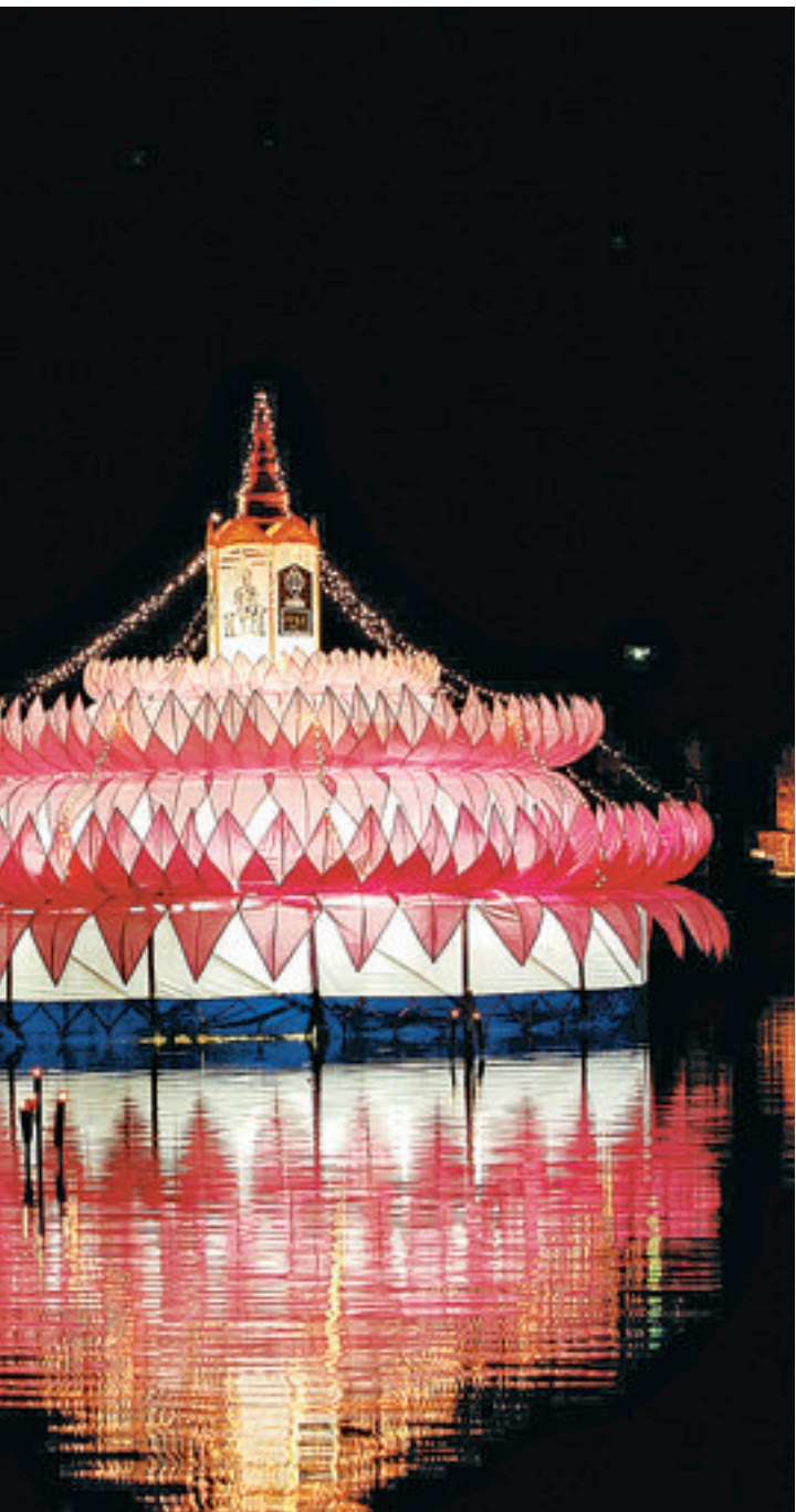
Loi Krathong and Candle Festival