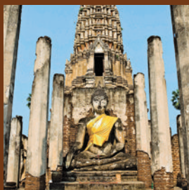
Wat Phra Si Rattana Mahathat , Si Satchanalai Historical Park