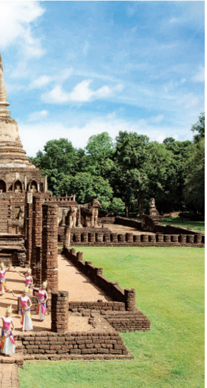
Si Satchanalai Historical Park