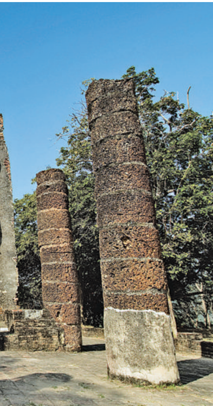
Wat Saphan Hin