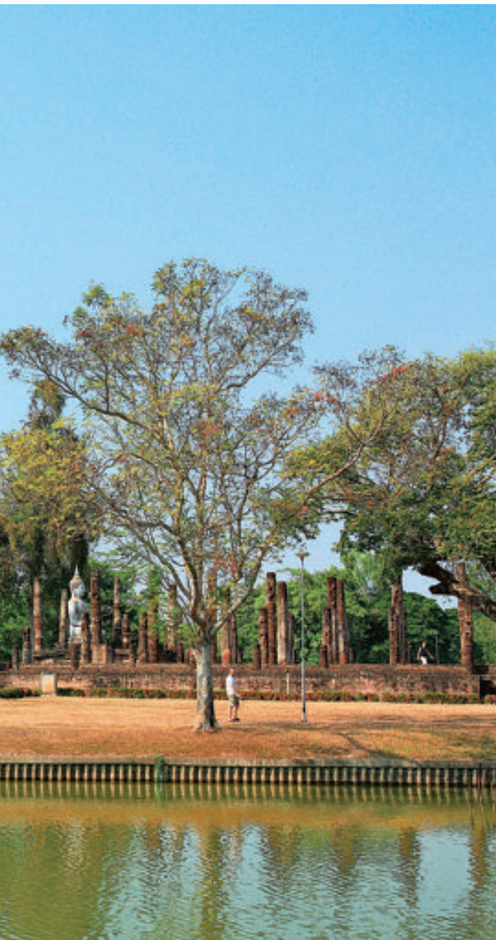
Wat Sa Si