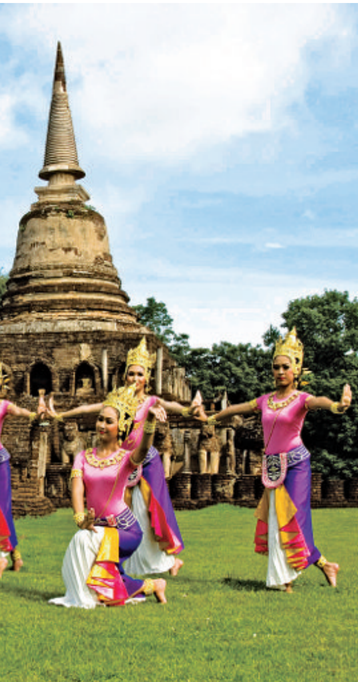
Si Satchanalai Classical dance