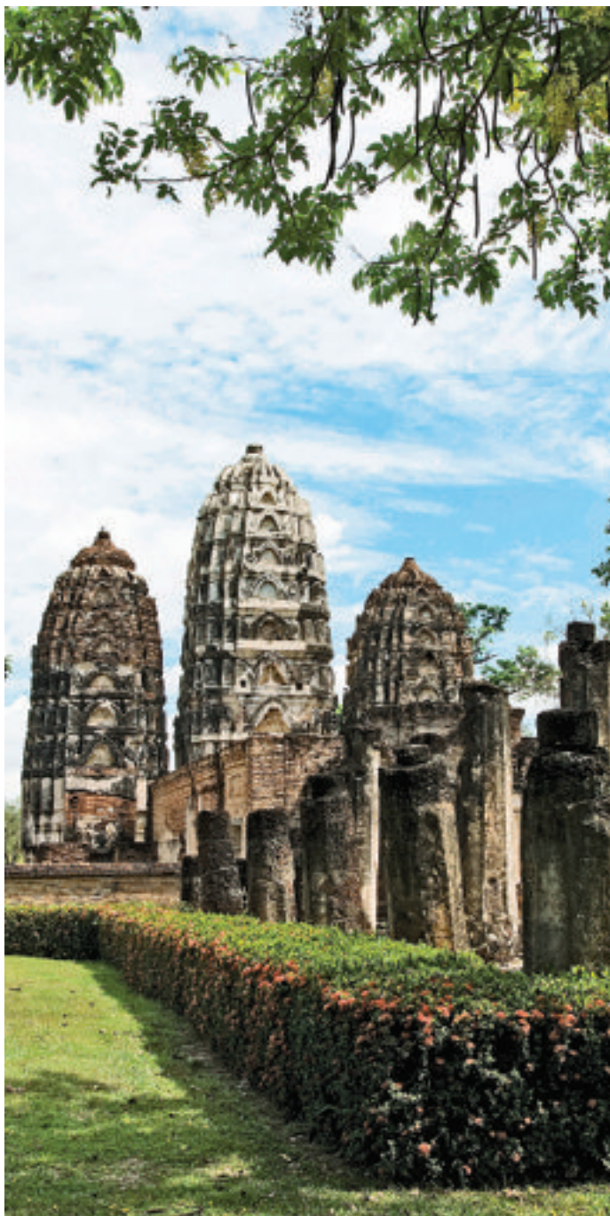
Wat Si Sawai