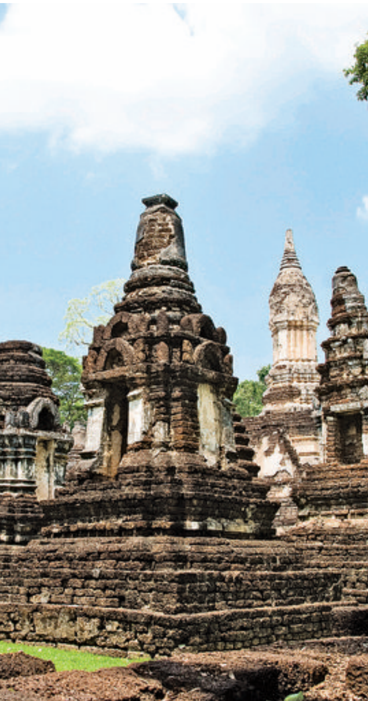
Wat Chedi Chet Thaeo