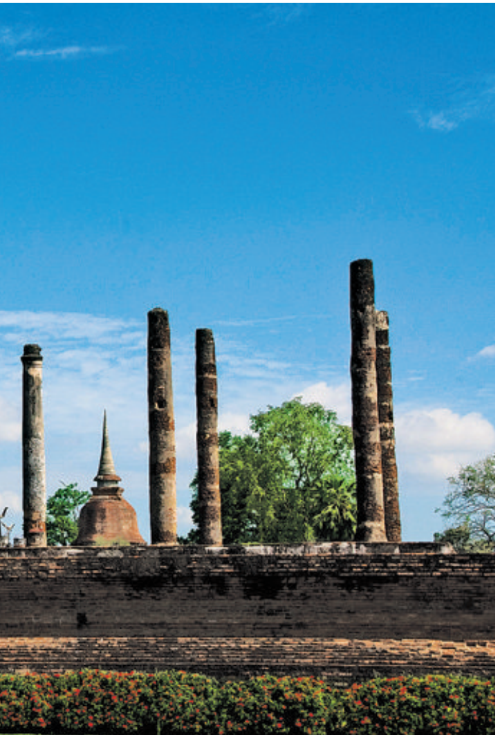
Sukhothai Historical Park or Old Sukhothai City

Places of interest in Sukhothai Historical Park are as follows: Inside the city wall