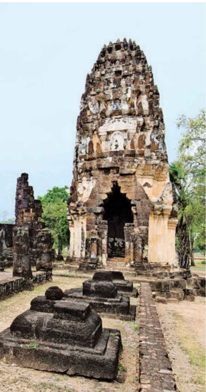
Wat Phra Phai Luang