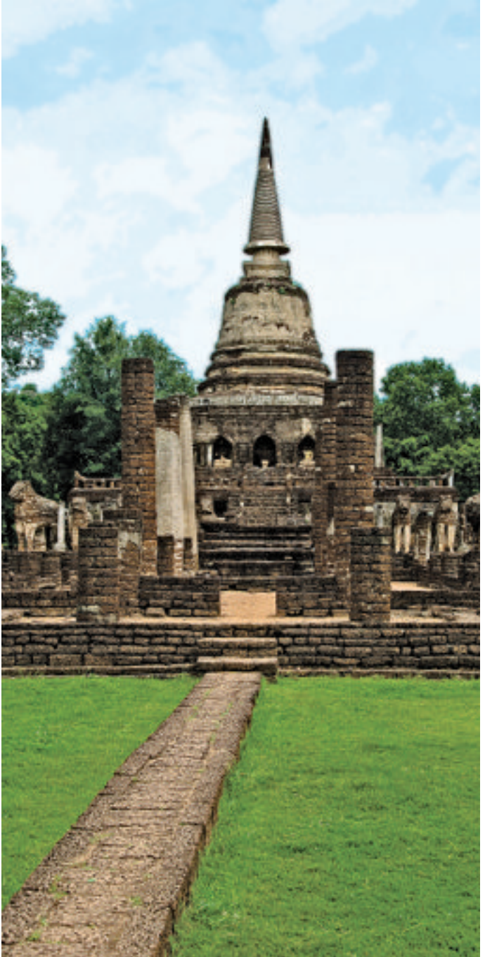
Wat Chang Lom