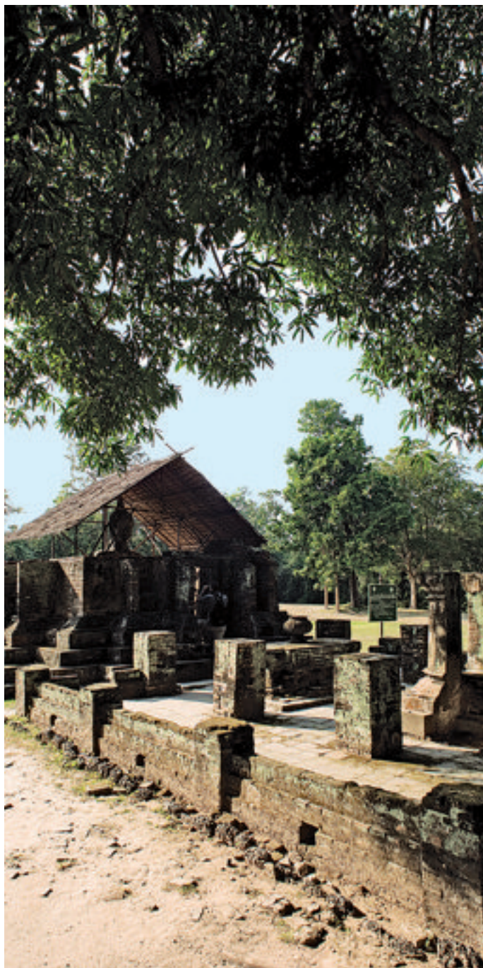
Wat Si Chum