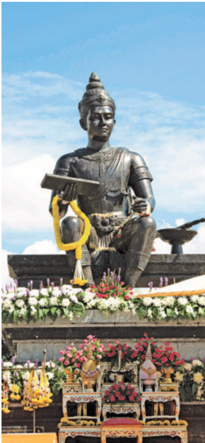
King Ramkhamhaeng the Great Monument