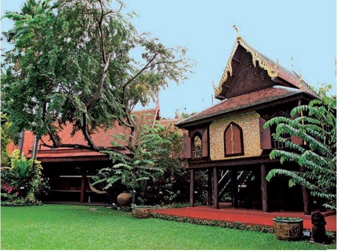
Suan Pakkad Palace

Open: Exhibition: Tue- Sun (except public holidays) from 9.00 a.m.-4.30 p.m.