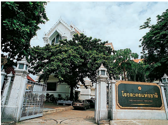
The National Theatre

Patravadi Theatre (ภัทราวดีเธียเตอร์) is near Wat Rakhang, Thon Buri. Renowned for its lavish productions, this outdoor theatre has gained popularity through its modern adaptations of classical Asian literature, with each play demonstrating an ingenious blend of various theatrical techniques. Showtime is on Friday, Saturday and Sunday. Call 0 2412 7287-8 or www.patravaditheatre.com for a current programme.