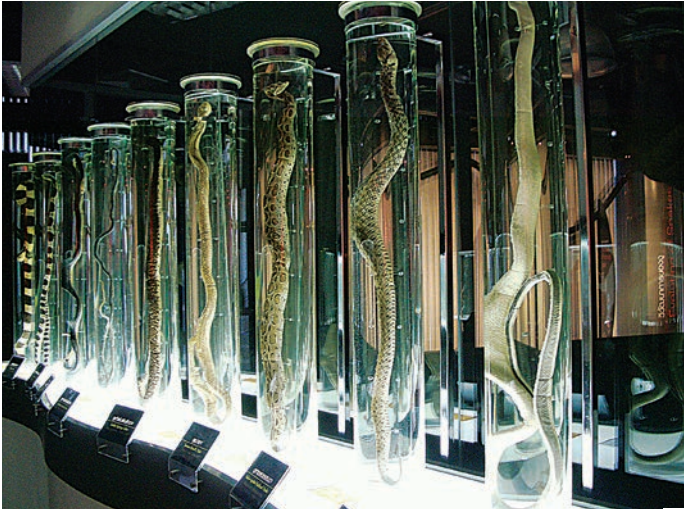
Queen Saovabha Memorial Institute (Snake Farm)

snakes which are “milked” daily for their venom in order to produce invaluable anti-snakebite serum.