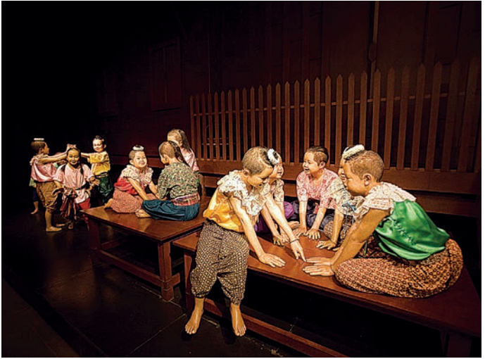
Thai Human Imagery Museum

Admission: Adults 200 baht, Child 100 baht.