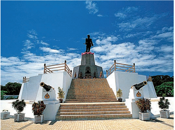
Pom Phra Chulachomklao or Pom Phra Chun