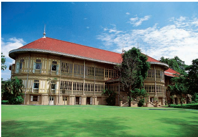
Vimanmek Mansion Museum

systems. It is located on the western side of Chatuchak Park adjacent to Kamphaeng Phet Road.