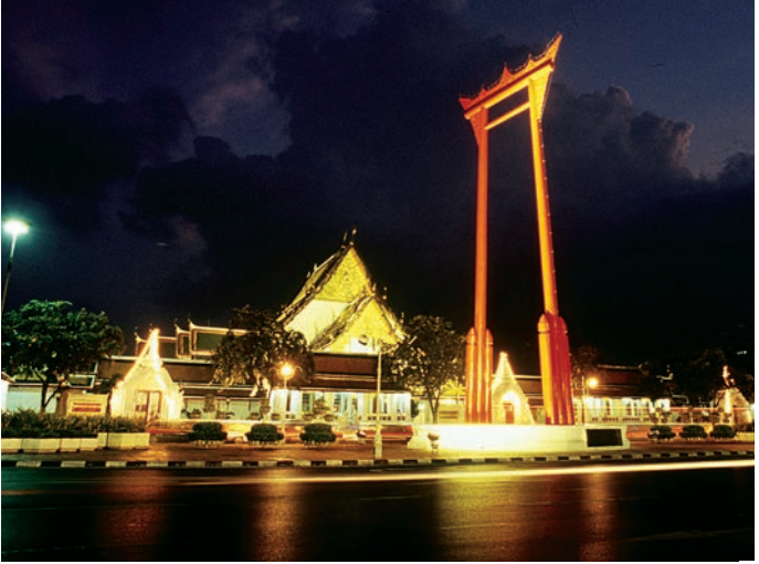
Wat Suthat and the Giant Swing