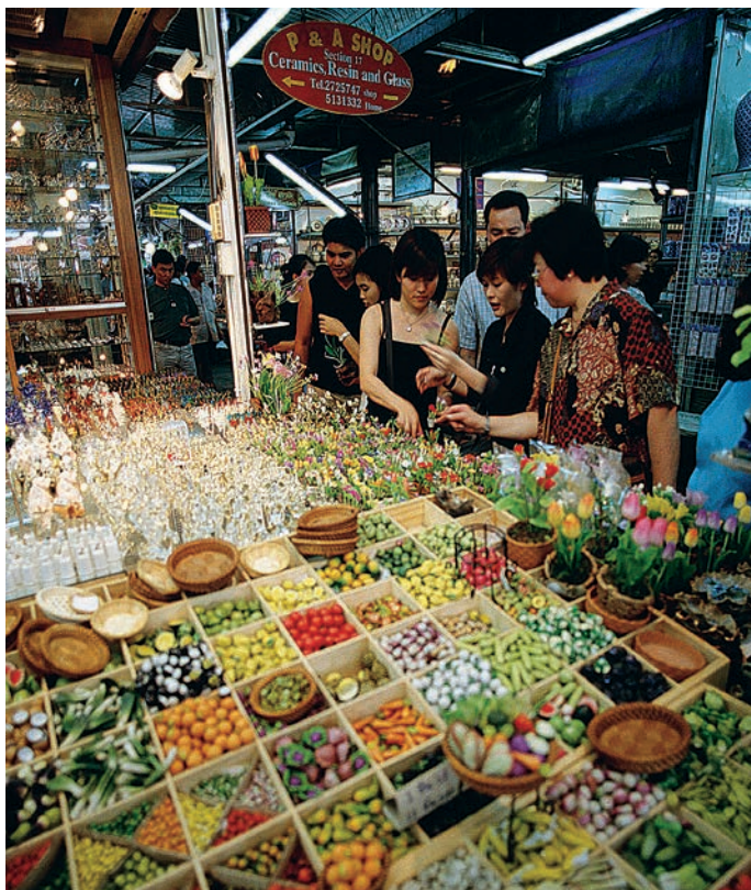
Jatujak or Chatuchak Weekend Market

It is located on Maharat Road near the Memorial Bridge. The market is crowded in the early morning and in the evening.