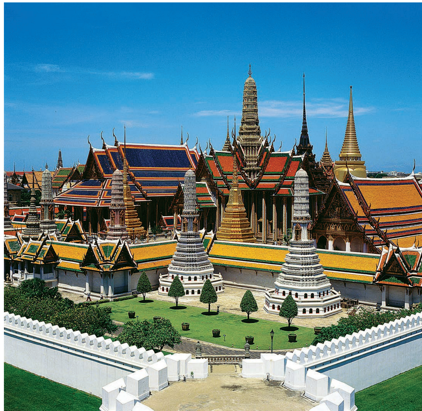
Wat Phra Si Rattana Satsadaram or Wat Phra Kaeo

Areas of Responsibility: Bangkok, Pathum Thani, Nonthaburi, Samut Prakan and Chachoengsao