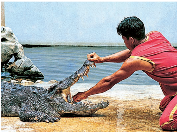
Samut Prakan Crocodile Farm and Zoo