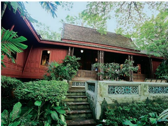
Jim Thompson Museum