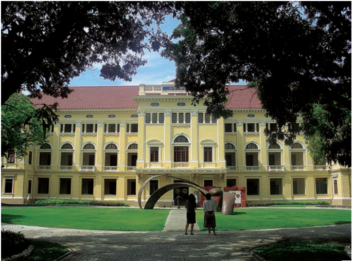
Museum Siam Discovery Museum

Museum Siam Discovery Museum (มิวเซียมสยาม พิพิธภัณฑ์การเรียนรู้) is located on Sanam Chai Road in Phra Nakhon District, in the former building of the Ministry of Commerce. This building won an outstanding award of art and architecture preservation in 2006 from the committee on art and architecture preservation of the Association of Siamese Architects under the Royal Patronage of His Majesty the King (ASA).