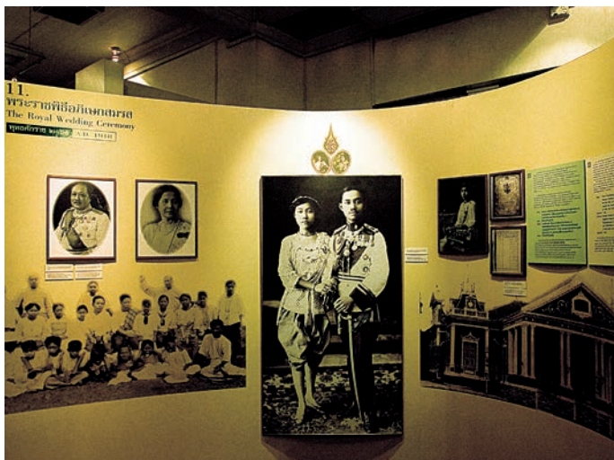
King Prajadhipok Museum

Tel: 0 2661 6470-7 or www.siam-society.org .