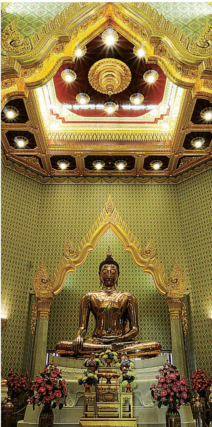
Wat Trai Mit