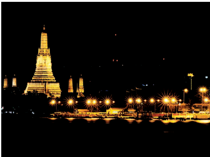
Wat Arun (Temple of Dawn)

Tel: 0 2628 6300 ext. 5119-5121 www.vimanmek.com