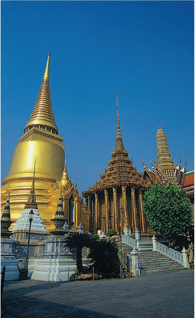
Wat Phra Si Rattana Satsadaram or Wat Phra Kaew

such as Phra Thinang Ratchakaranyasapha, Phra Thinang Munlasathan Boromma-at, Phra Thinang Sommutithewarat Upbat, Phra Thinang Borommaratchasathit Mahoran, Phra Thinang Chakraphatdi Phiman, Phra Thinang Phaisan Thaksin, etc.