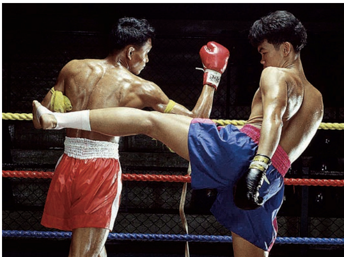
Muai Thai or Thai boxing