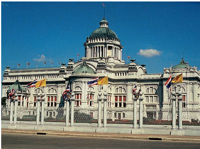
Anantasamakhom Throne Hall

The replicas were elaborately constructed in both smaller-scaled sizes, while some are in the actual size. Besides, it is a source of local Thai arts and culture which is disappearing from modern society. Those who wish to conduct research on the history of Thailand can study this at the Ancient City.