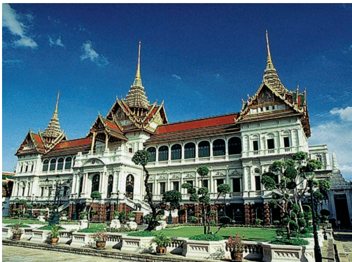
Phra Thinang Chakri Maha Prasat

floor plan to that of the Grand Palace in the Kingdom of Ayutthaya. The Temple of the Emerald Buddha is a palace temple just as Wat Phra Si Sanphet used to be in the Ayutthaya Period. A blend of Western architecture prevailed during the reigns of King Rama IV and King Rama V. Major throne halls include: