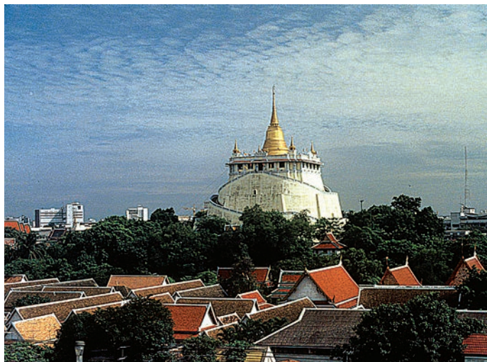
Wat Saket and The Golden Mount

constructed during the reign of King Rama V. It employs European ecclesiastic details, such as stained glass windows, and contains a superb cloister collection of bronze Buddha images.