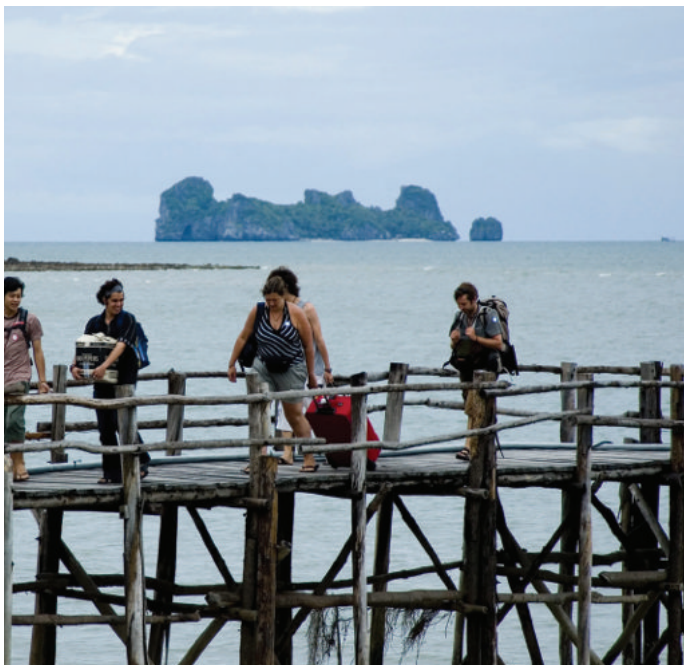
Tha Yang Pier

How to get to Ko Tao from Chumphon : Visitors who want to visit Ko Tao can take the boat services from the below piers,