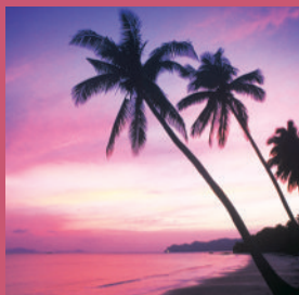
Ao Thung Makham Noi