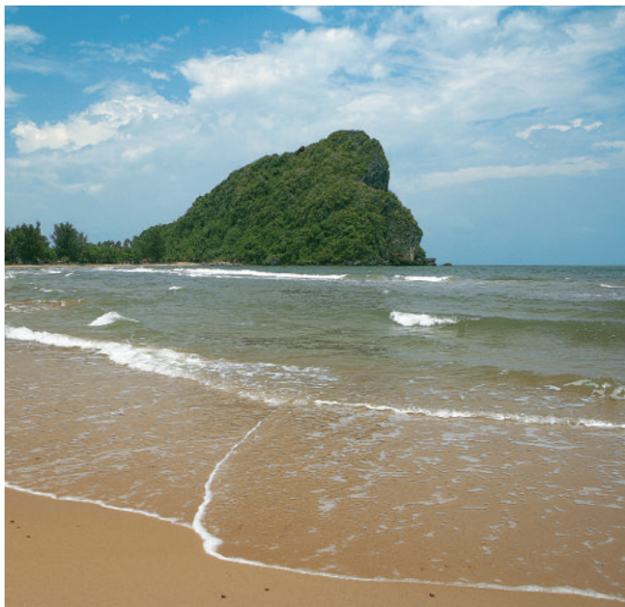
Hat Tham Thong - Bang Boet

Located at Mu 3, Tambon Chumkho. Starts from Highway No. 4 on Phetchakasem Road (Chumphon-Pathio Road), take Highway No. 3201 until reached the guidepost at Tambon Chumkho area. The area is covered with limestone mountain range in beautiful shape, parallel to the road. This is the habitat of 3 flocks of southern langurs. They will come down to find some foods in the evening.