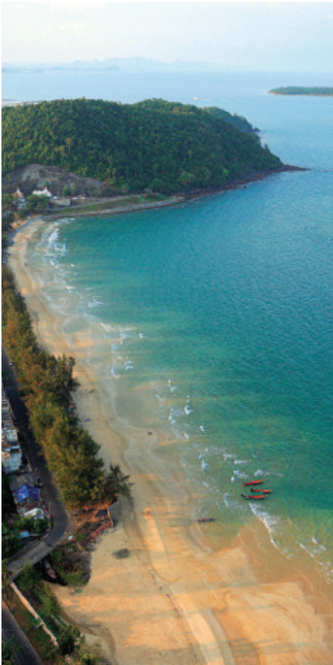
Hat Sai Ri