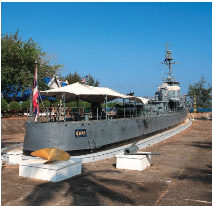
Prince Chumphon War Ship

Hat Sai Ri (Sai Ri Beach) (หาดทรายรี) This scenic white sandy beach is approximately 20 kilometres from Chumphon on Highway No. 4119 and 4098. There are bus services from town to the beach. Around the corner of the beach, there is the monument of Prince Kromluang Chumphon Khet Udomsak who found the Royal Thai Navy. This place is the sacred place of the people in Chumphon and nearby provinces. The old and new shrine including Mor Porn Herbs Garden are also situated here on the foothill along the seacoast.