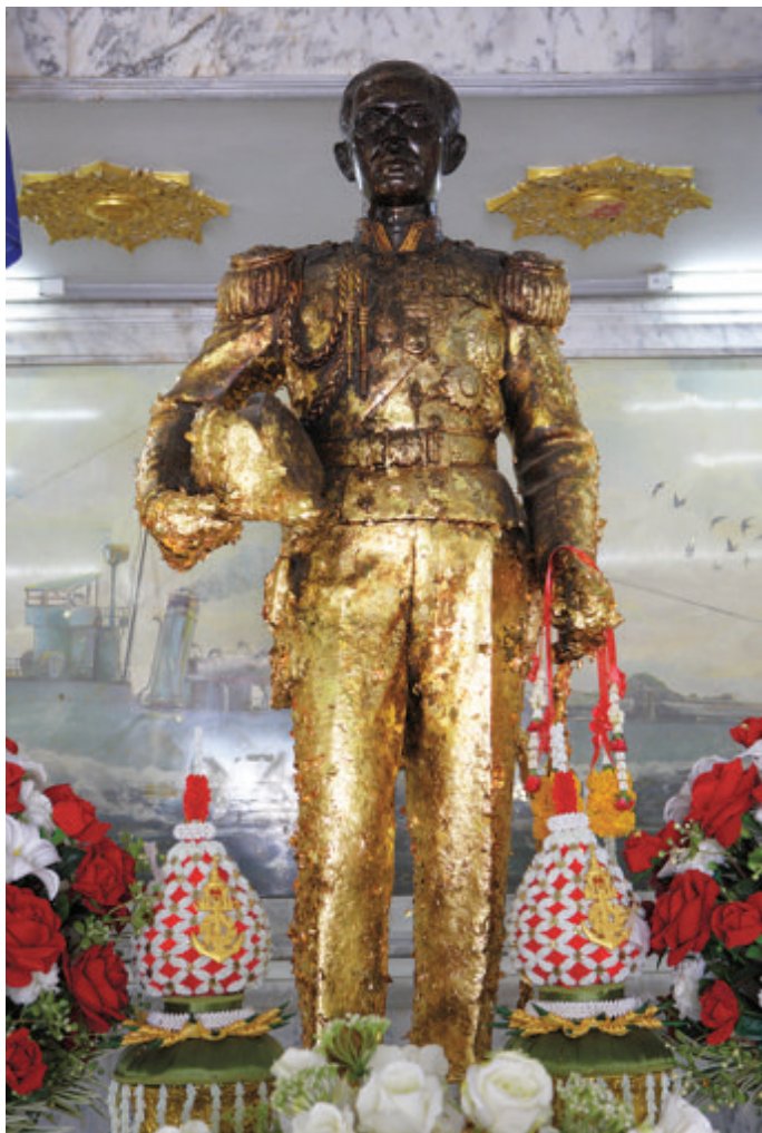
The Monument of Prince Kromluang Chumphon Khet Udomsak