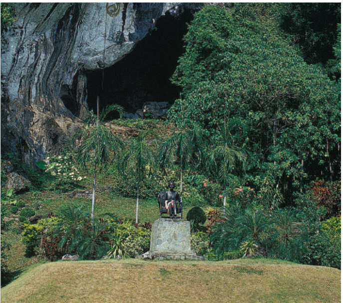
Somdech Phra Srinagarindra Park

Somdech Phra Srinagarindra Park (สวนสมเด็จพระศรีนครินทร์) Located at Mu 8, Ban Khao Ngen, Tambon Tha Mapra, approximately 65 kilometres from Chumphon by turning right at Amphoe Lang Suan junction (Opposite of Amphoe Lang Suan's entrance) for another 3 kilometres. This park is a good place for relaxation. There are the ornamental plants garden and the statue of the