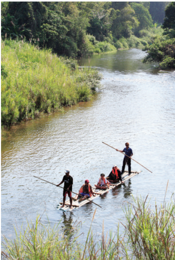
Phato Canal Water Rafting

Fireflies Sightseeing (ล่องเรือชมหิ่งห้อย) Fireflies Sightseeing is one of the most interesting activities of Chumphon which arranged for visitors all year round. Visitors will spend 2 hours at night (Boat size : 10 Persons/Boat/150 baht). For reservation, please contact Mu Ko Chumphon National Park office Tel : 0 7755 8144 or travel agents in Chumphon.