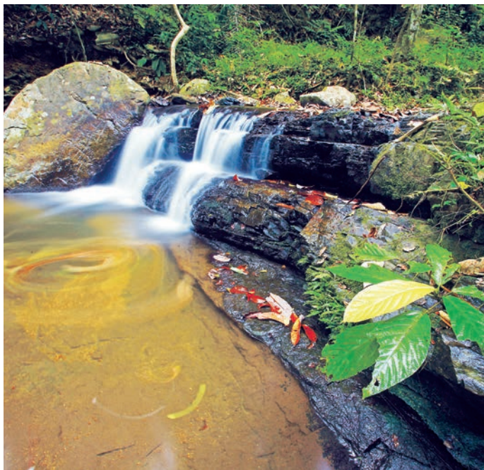
Namtok Huai To, Khao Phanom Bencha National Park