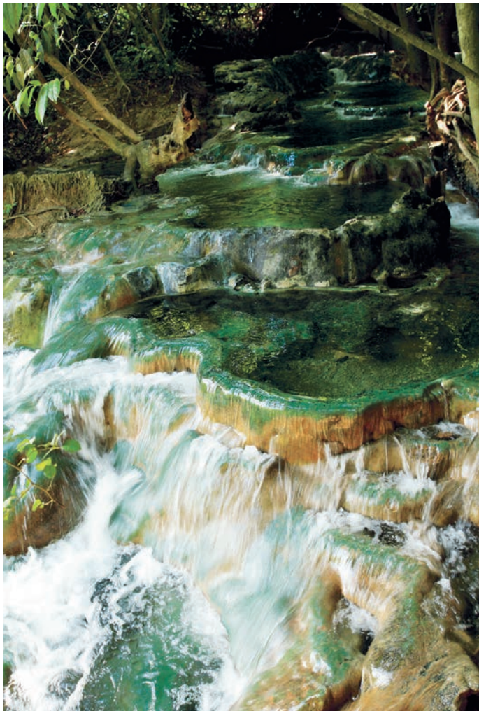
Namtok Ron Khlong Thom