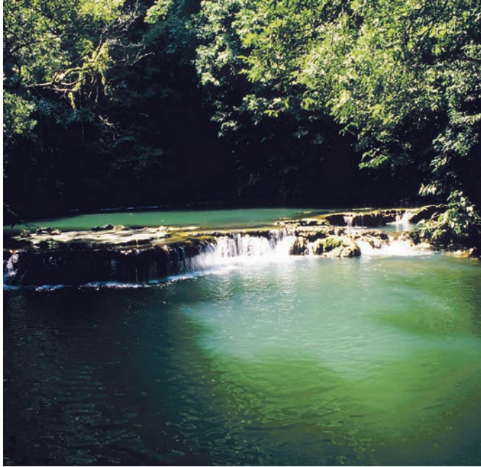
Than Bok Khorani National Park

Tham Lot can be reached by boat from Bo Tho Pier. The pier is located 2 kms. from Amphoe Ao Luek on the way to Laem Sak, where visitors can ride a long-tail boat along a canal passing through mangrove forests for 15 minutes. Tham Lot is a tunnel under a limestone mountain where a natural stream runs through a small tunnel and charming stalactite and stalagmite formations are found. The cave can be visited only during low tide.