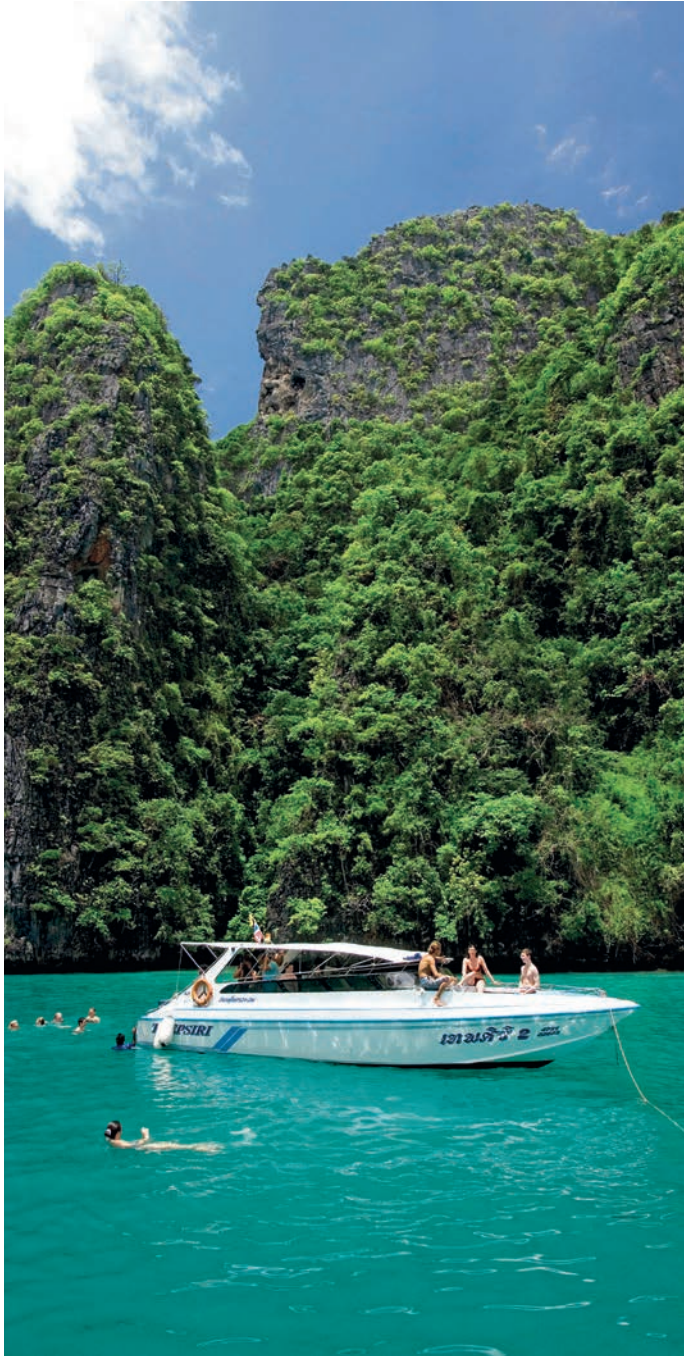
Ao Pi Le