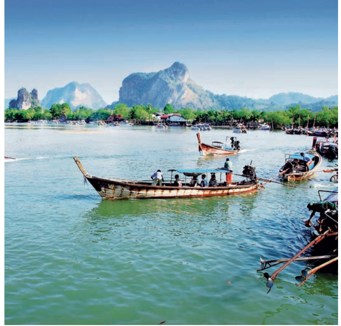
Khao Khanap Nam

Situated some 20 km. from town, Ao Nang's white sandy beach stretches to the foot of a prominent limestone range. Beachfront accommodation is available and other facilities include diving shops, boats for rent and sightseeing by kayaking. From Ao Nang, tourists may hire boats to visit