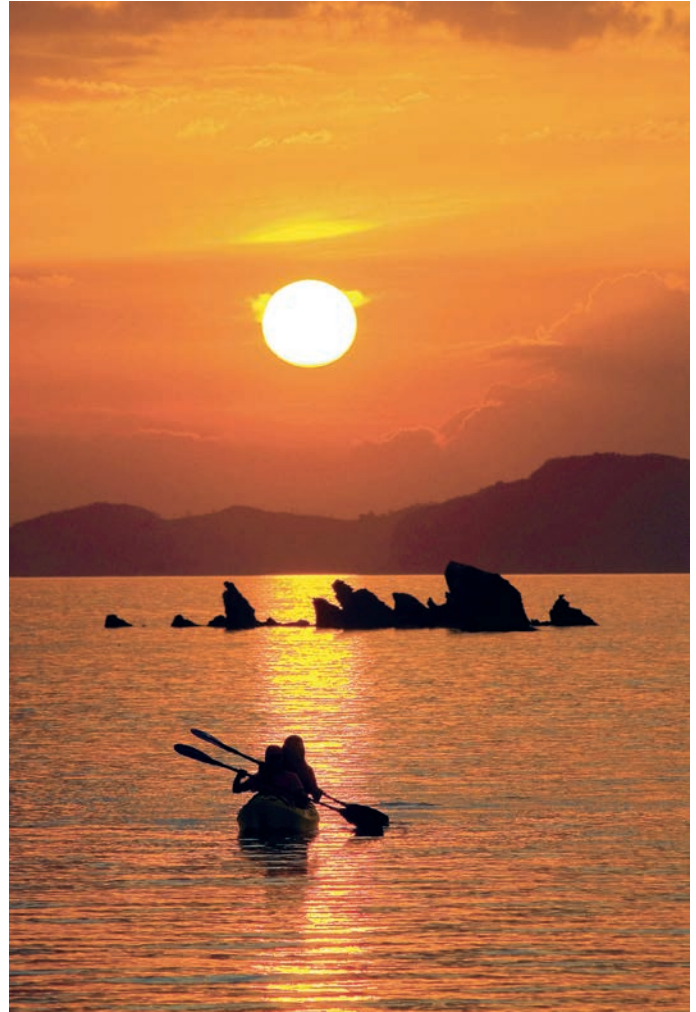
Hat Thap Khaek

situated here. The park covers a large area both onshore and offshore. Visit www.dnp.go.th for more information.