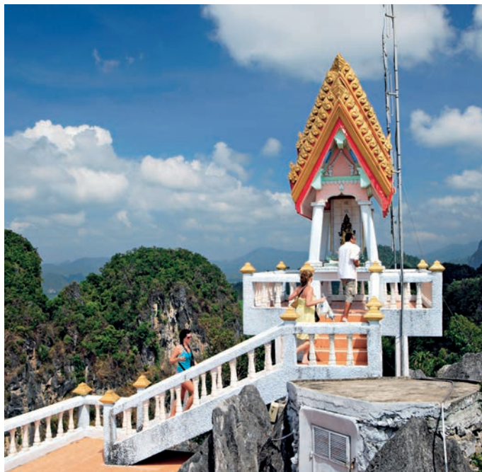
Wat Tham Suea