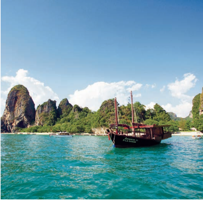
Hat Rai Le