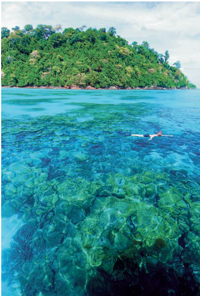
Ko Rok, Muko Lanta Marine National Park

Ko Rok comprises of two islands - Ko Rok Nai and Ko Rok Nok . Ko Rok Nai is an island consisting of steep cliffs, superb beaches and unspoiled coral reefs. Ko Rok Nok has similar features, while Hat Thalu and Ao Man Sai are situated at the end of the island. Tourists can contact tour operators, resorts and bungalows on Ko Lanta Yai for an excursion to Ko Rok by speedboat. The trip by long-tail boat is not recommended.