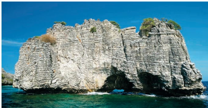
Ko Hin Ha Luk, Muko Lanta Marine National Park

Ko Talabeng is a limestone island, similar to Ko Phi Phi Le, and blessed with small lovely beaches. During low tide, the cave is clearly visible. Swallows can be seen on the island.