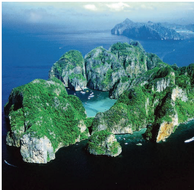
Ko Phi Phi Le

Ko Phi Phi Don covers an area of 28 sq. kms. Laem Tong in the north offers beautiful marine nature. Diving can be done as well at Laem Hua Raket, Hat Yao and Hin Phae. A number of accommodations is available.