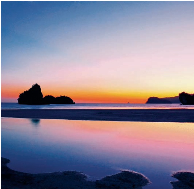
Hat Noppharat Thara

This is a 3-km. long sandy beach located 6 kms. from Ao Nang. The beach, paved with tiny seashells, was formerly called “Hat Khlong Haeng” by locals, which means “dried canal beach”. The canal will dry up during low tide and the area turns into a long beach. The headquarters of Hat Noppharat Thara-Muko Phi Phi National Park are