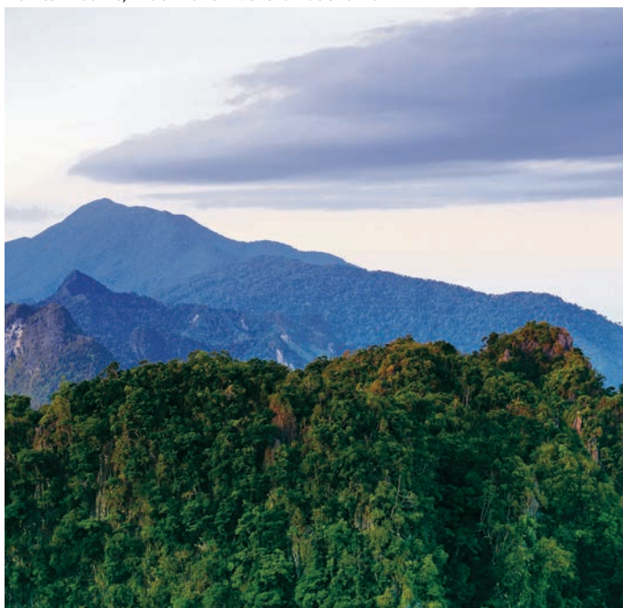
Khao Phanom Bencha National Park

Bencha Mountain, 1,397 metres high, is an interesting activity for adventurous tourists. Treks take at least 3 days, passing streams, waterfalls, caves and viewpoints on high cliffs. Contact the headquarters of Khao Phanom Bencha National Park, P.O. Box 26 Amphoe Mueang, Krabi 81000, Tel. 0 7566 0717.