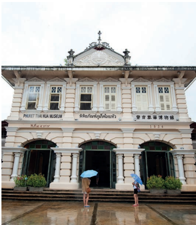
Phuket Thai Hua Museum

foods, tradition and culture of Phuket. It is located on 28, Krabi Road, Tambon Talat Yai, Amphoe Mueang Phuket, Phuket. Tel. 0 7621 1224. The Museum opens from Monday - Sunday, except Wednesday, between 08.30 a.m - 05.30 p.m.