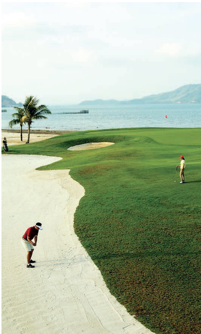
Phuket Mission Hills Golf Resort & Spa

รีสอร์ท แอนด์ สปา) 195 Mu 4, Tel. 0 7631 0888, Fax : 0 7631 0899.