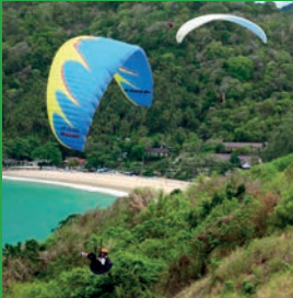
Hat Nai Han