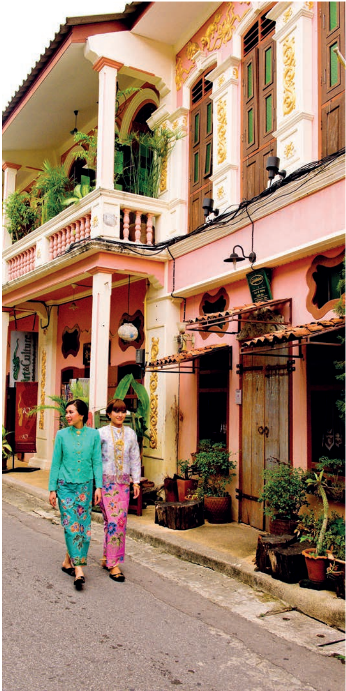
Old Town Phuket

1600 Phetchaburi Road, Makkasan Ratchathewi, Bangkok 10400 Tel. 0 2250 5500 (120 lines) Fax: 0 2250 5511 E-mail: info@tat.or.th Website: www.tourismthailand.org