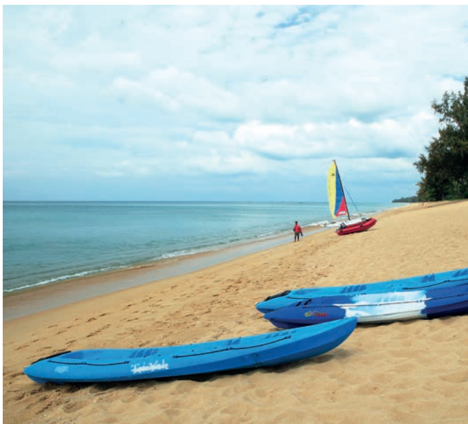
Hat Mai Khao

Hat Nai Yang (หาดในยาง) is where the Park headquarters are located. The beach is blessed with shady pine trees providing an excellent opportunity for swimming and relaxation. Off-shore is a large coral reef which serves as habitat for several species of sea life, particularly sea turtles.