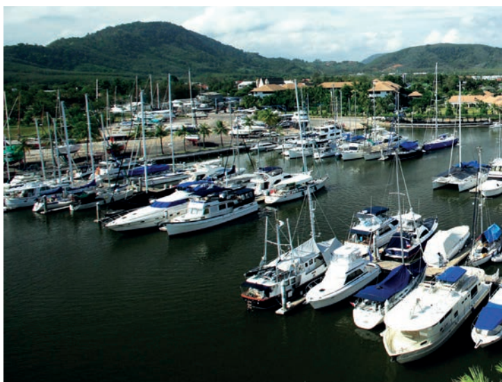
Boat Lagoon Pier

Nikita Fishing (นิคิต้า ฟิชซิง) 180 Rat Uthit Song Roi Pi Road, Tel. 0 7634 0833.