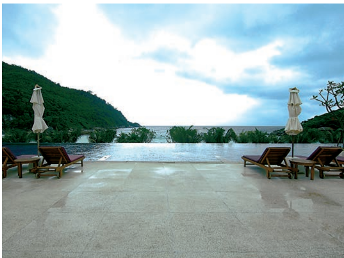
Accommodation in Phuket

Phuket is also the source of several of the country's finest gifts and souvenir products including cultured pearls, neilloware, pewterware, ornaments and dried seafood. Specialist shops dealing in souvenir products can be found on Ratsada, Phang-nga, Montri, Yaowarat, and Dilok Uthit Roads, in Phuket Town, Thap Krasatri Road, north of town and at the beach centres of Patong, Kata, Karon and Rawai. Among the best buys the island has to offer are Batik - crafted by the island's numerous artists into T-shirts, dresses, wall hangings, and bed covers - beachwear and easily-affordable made-to-measure cotton, linen and silk clothing - courtesy of the island's many tailors. Thalang Road, in Phuket Town, is home to many cloth merchants, offering excellent deals on a wide selection of cloth, which the island's tailors will be happy to convert into the fashion statement of the customer's choosing.