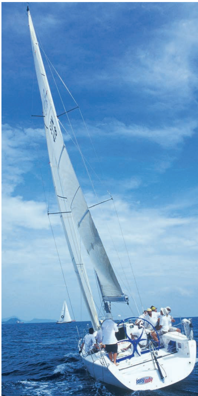
Phuket King's Cup Regatta