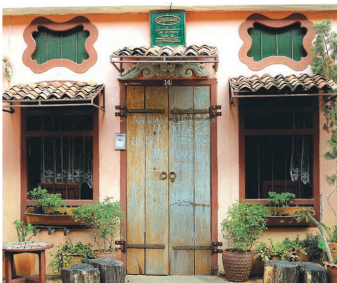
A Building in Old Town Phuket