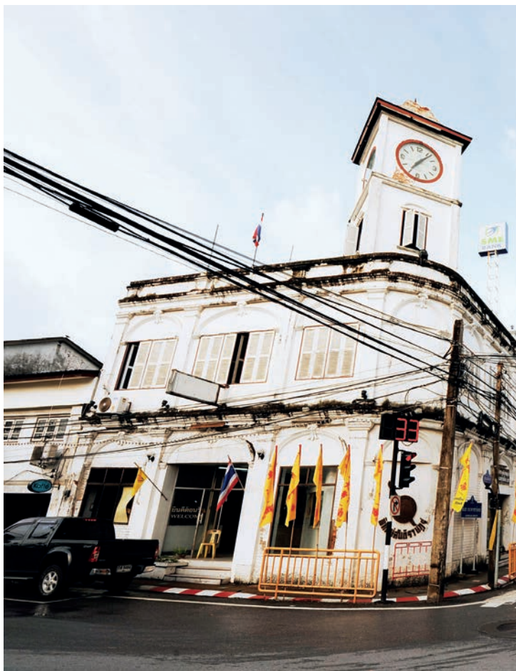
Sino-Portuguese Architecture in Old Town Phuket

still well preserved. The architectural style, typical of the region, is described as Sino-Portuguese and has a strongly Mediterranean character. Shops present a very narrow face onto the street but stretch back a long way. Many, especially on Dibuk Road, have old wooden doors with Chinese fretwork carving.