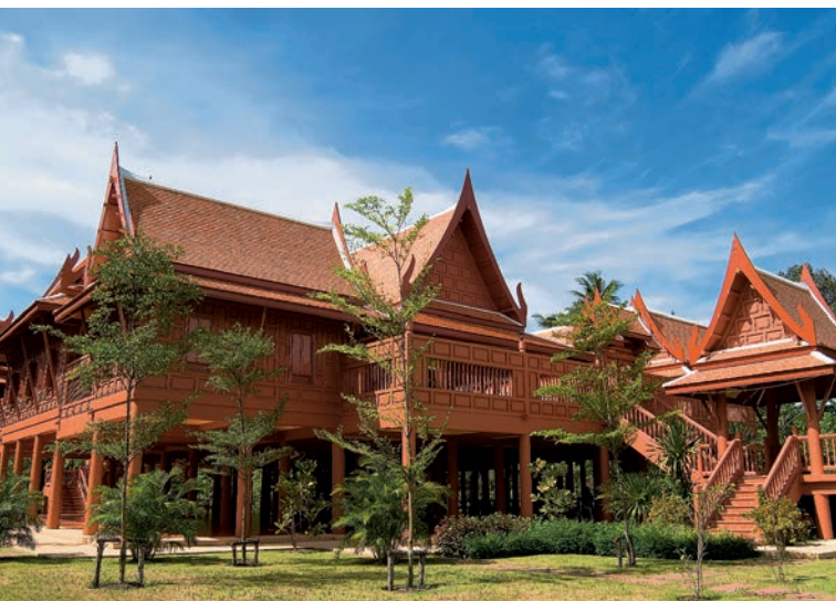
King Rama II Memorial Park

trees and decorative plants. The Kitchen and Restroom display a Thai kitchen with kitchenware and crockery, and a restroom of the middle class.