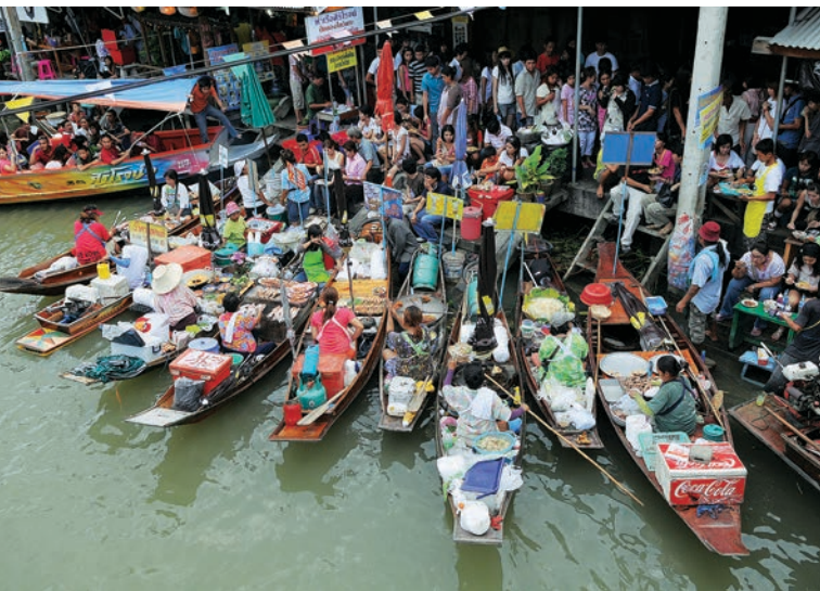
Amphawa Floating Market

sea mussel, noodles, coffee, O-liang (iced black coffee), sweets, etc. There are also things for sale on wheelbarrows on the bank. Visitors can enjoy a cosy atmosphere and music broadcast by the community members, explore the market, have food, and hire a boat to see fireflies at night.