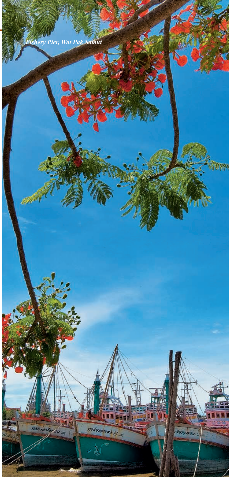
Fishery Pier, Wat Pak Samut