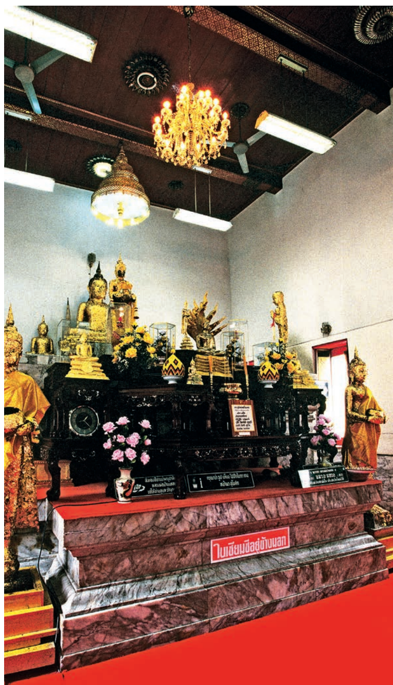
Wat Ban Laem

Most of the villagers of Ban Laem are fishermen. Once they went fishing in Ao Mae Klong and found two Buddha images in their trawl net. One was a seated image and the other was a standing figure. The seated image was brought to Wat Khao Takhrao in Amphoe Ban Laem, Phetchaburi, while the other was enshrined here in Wat Ban Laem and commonly called “Luangpho Ban Laem.”