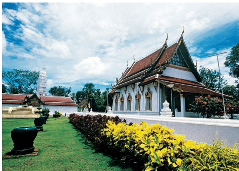
Wat Amphawan Chetiyaram

By bus : Take a bus at the Municipal Market of Amphoe Mueang Samut Songkhram, routing from Mae Klong to Bang Nok Khwaek and Ratchaburi, and get off in front of Wat Amphawan Chetiyaram.