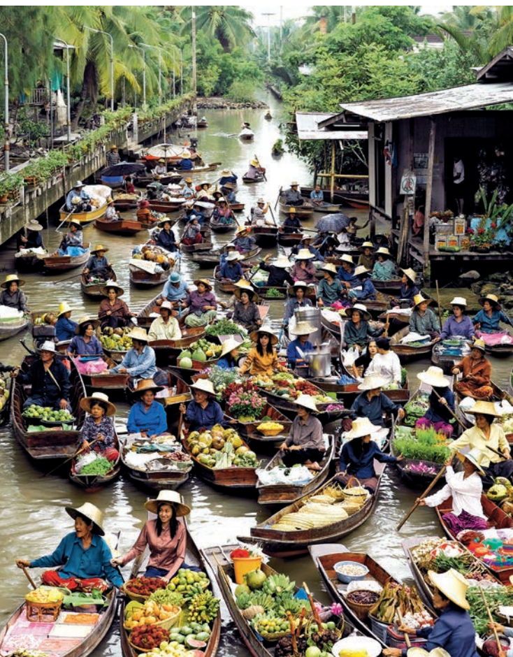
Tha Kha Floating Market