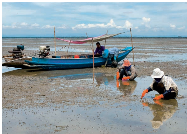
Don Hoi Lot

Don Hoi Lot (ดอนหอยหลอด) This famous tourist attraction of Samut Songkhram is a bar on the mouth of the Mae Klong River. It was formed by the sedimentation of sandy soil called by villagers here as “Sai Khi Pet.” The bar of 3 km. wide and 5 km. long covers two zones: Don Nok is on the mouth of Ao Mae Klong, accessible by boat; and Don Nai is located on the beach of the Chuchi village in Tambon Bang Chakreng and on the beach of the Bang Bo village in Tambon Bang Kaeo, accessible by car. In the area of the bar, there are many shellfish, such as Hoi Lot (razor clam), Hoi Lai (undulated surf clam), Hoi Puk (Ridged Venus clam), Hoi Pak Pet (tongue shell), Hoi Khraeng (cockle), etc. Hoi Lot is mostly found here and it has become a landmark of this place.