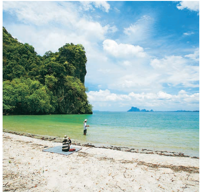
Hat Chao Mai National Park

is a marine national park covering 2 districts that are Kantang and Sikao. The Park's coastline is about 20 kilometres. The Park headquarters is at Chang Lang Beach in Tambon Mai Fat, approximately 47 kilometres from the city. To get there, take the Trang-Sikao-Pak Meng Road (Highway No. 4046-4162) and then 4 kilometres more on a road parallel to the beach to the Park headquarters. Land-