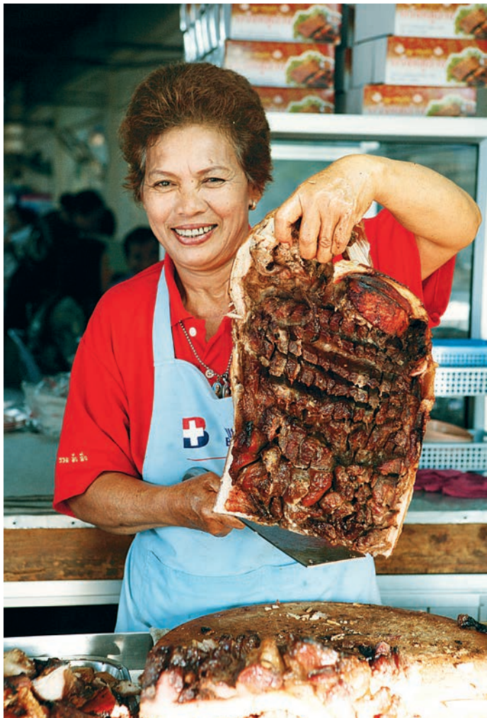
Trang Roast Pork

Trang Roast Pork Festival (งานเทศกาลหมูย่างเมืองตรัง) is a tourism promotion activity of Trang, held every September. The Festival features the mouthwatering roast pork of a special recipe of Trang. The pork skin is crispy, the meat is tender and it is delicious due to a process by which the pig is fermented with herbs then roasted whole on a specially made grill. Trang's roast pork is sold daily and goes well with morning coffee or can be a dish at banquets.