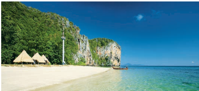
Ko Lao Liang Nuea