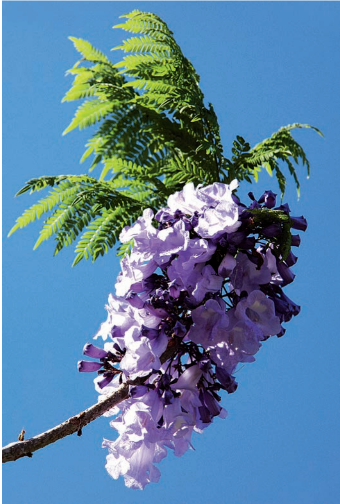
Elegant Jacaranda Flowers