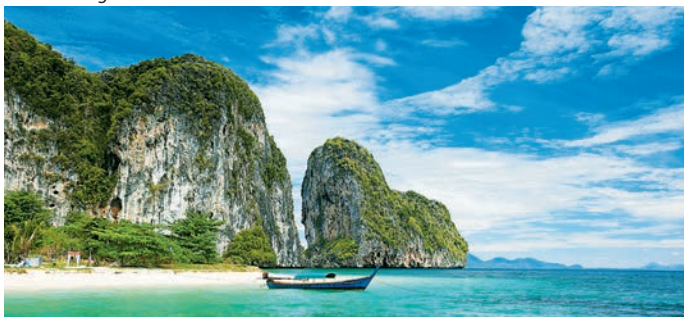
Ko Lao Liang Tai