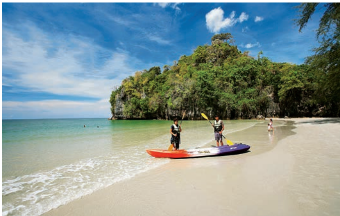
Hat Yong Ling

is on the way to Chao Mai Beach and a 2-kilometre road leads to Yong Ling Beach. This curved beach runs parallel to a pine forest. At the beach's end is a high mountain with