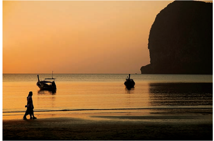
Hat Pak Meng

Rajamangala University of Technology Srivijaya, Trang Campus, Tambon Mai Fat. The Aquarium has 61 display tanks, not including fishponds, and has both freshwater and marine fish, amphibians and the most realistic model of a mangrove forest. It is open daily during official hours. Admission is 50 baht. Please call Tel. 0 7520 4051-6, visit www.fishtech.rit.ac.th .