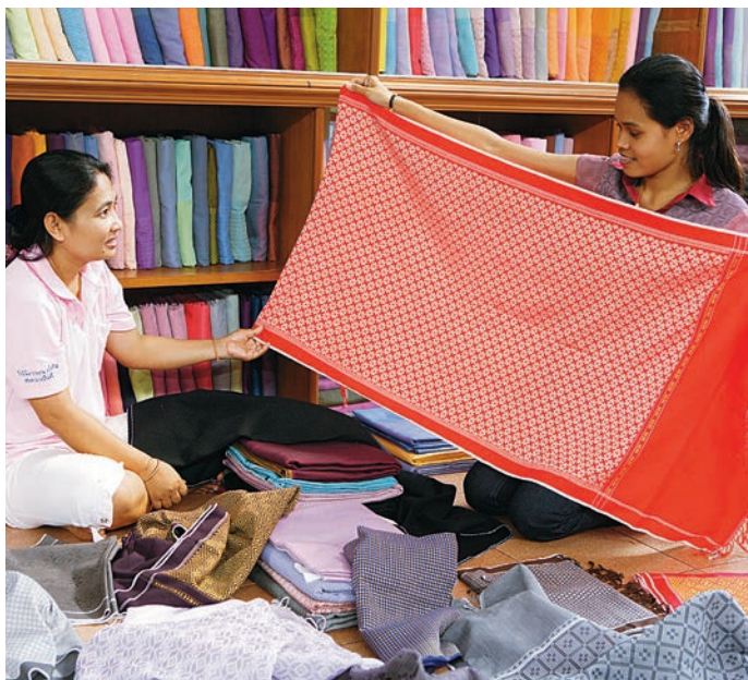
Na Muen Si Woven Textile

produces unique woven textiles with various intricate patterns suitable for men's and women's clothing. There are also souvenir products; such as, handkerchief, pencil holder, etc. For further information, please contact the Na Muen Si Weaving Group at Tel. 0 7558 3524.