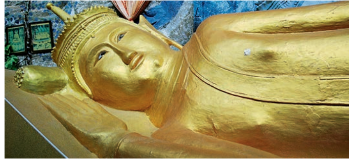
Phra Non Song Khrueng Nora

is at Wat Phukhao Thong, Mu 1, Tambon Nam Phut, around 20 kilometres from the city. The Buddha image is in