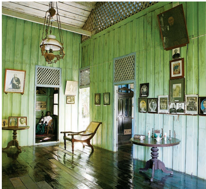
Phraya Ratsadanupradit Mahison Phakdi Museum

is around 200 metres from Kantang Municipality at No. 1, Khai Phithak Road, Tambon Kantang. It is an important historical site, which is the "old Trang governor's house" or the house of Phraya Ratsadanupradit, a former ruler of the province. The house is a two-storeyed wooden building.