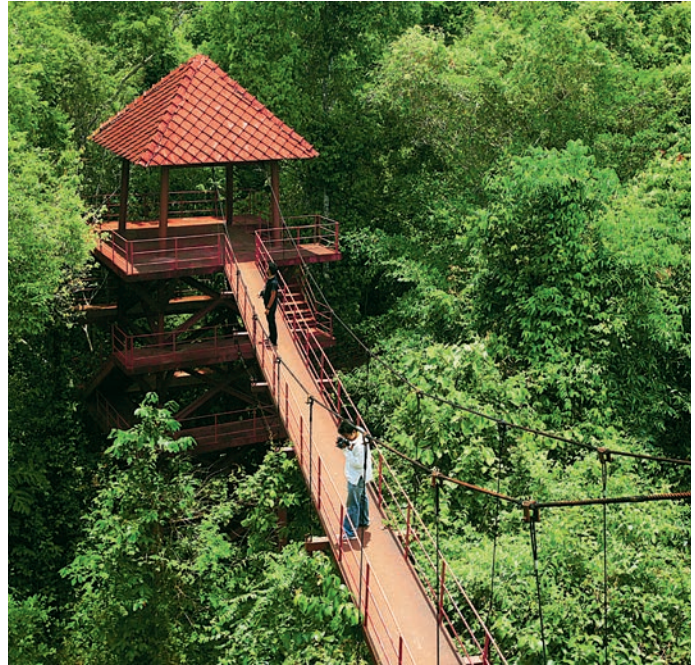
Peninsular Botanic Garden (Thung Khai)

can be reached via taking the Trang - Palian Road (Highway No. 404) to Km. 11. This is a new tourist destination for those interested in studying nature and flora in particular. Inside the park is a tourist service centre, a botanical garden, an herbal garden, a botanical library, a plant museum, and a technical meeting centre. The most important aspect of the park is the many nature trails available, all going through a lowland jungle, as well as a forest with many interesting plant species. A major nature trail includes the Canopy